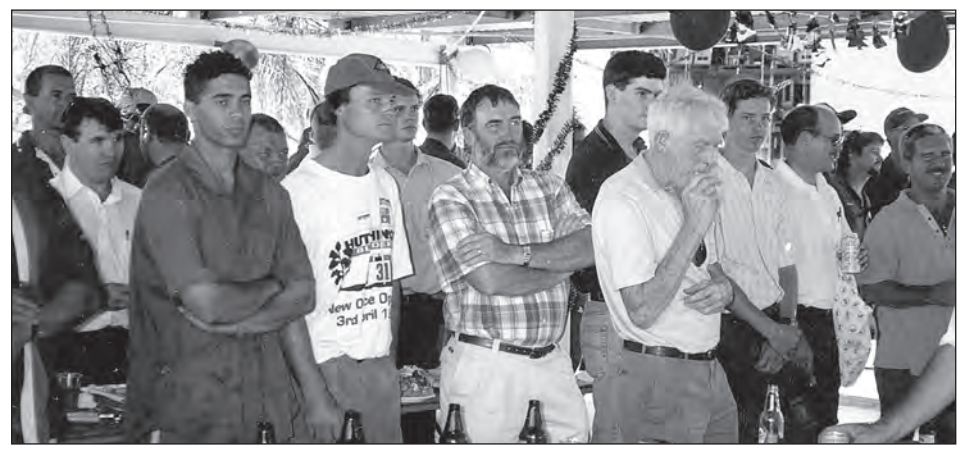
A more serious part of the family rivetted by Christmas speeches.