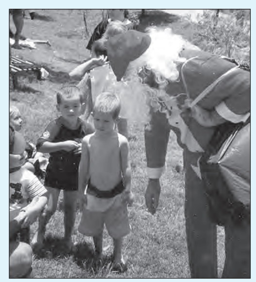
Santa greets some of the children.